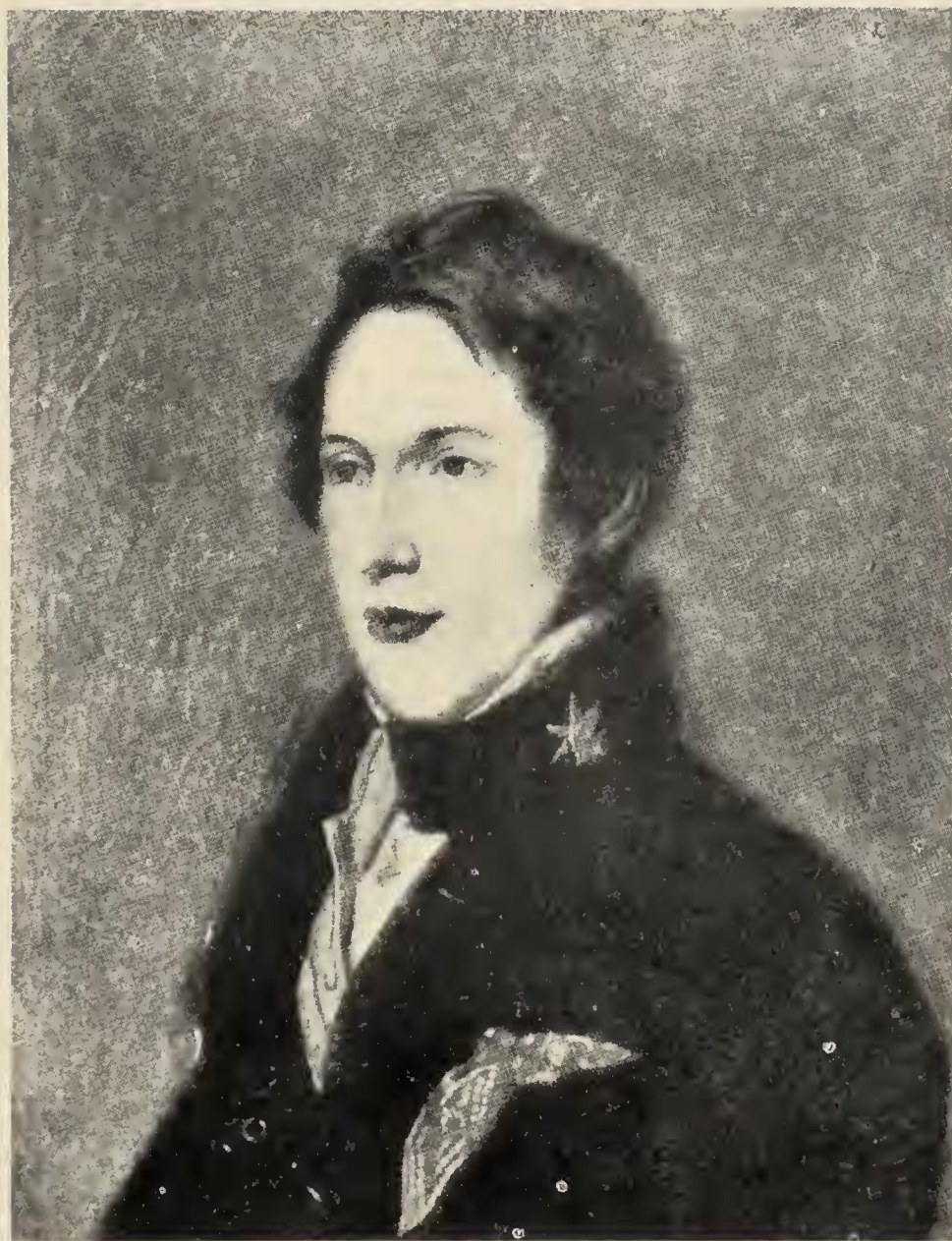
FIG. 8. Titian Ramsey Peale.